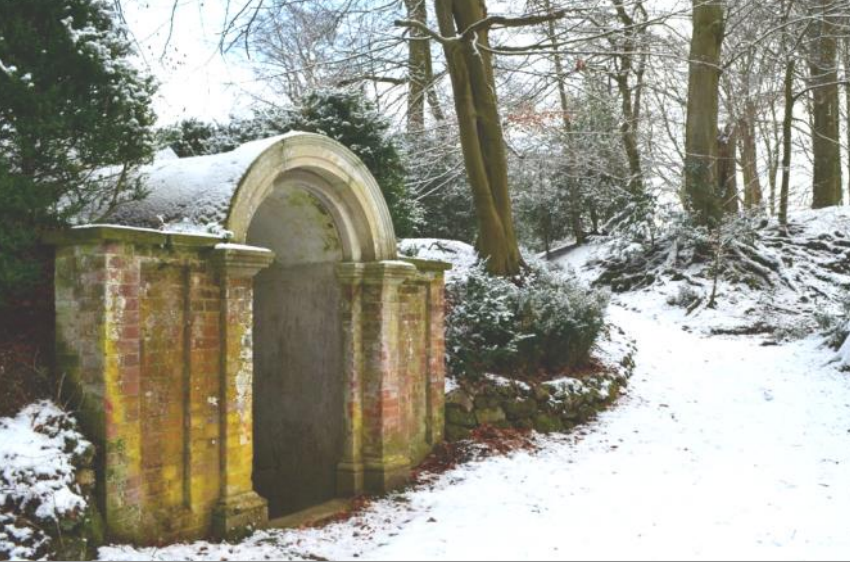
How Did We Manage Before Refrigerators? Hatchlands Ice House