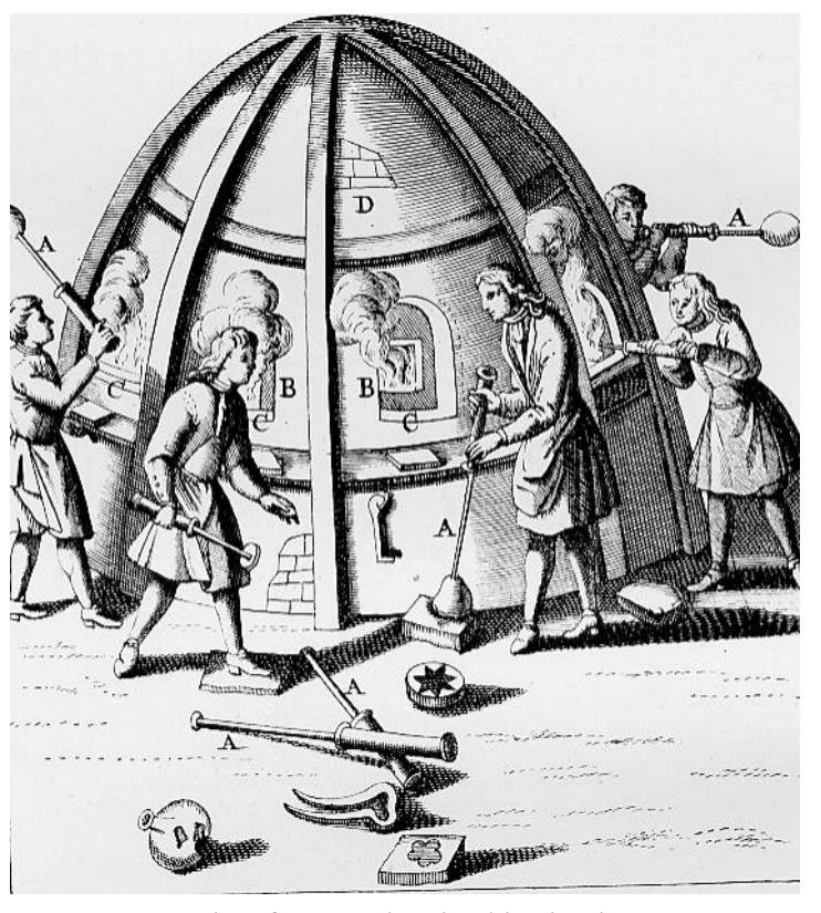
17c glass furnace; showing blowing-irons, moulds and a broken wine bottle

Until the mid-sixteenth century the glass industry elsewhere in England was virtually non-existent, glass being mostly imported from France. As an example of how precious glass was at that time, it is recorded that when the Duke of Northumberland left Alnwick castle the steward was accustomed to take out the glazed windows and stow them away safely until the Duke's return.