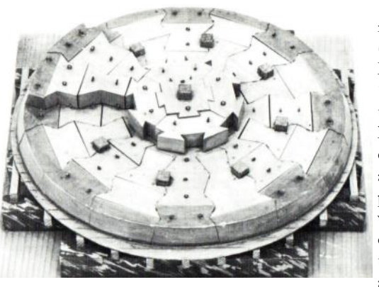
Model of the lower course of stonework of Eddystone lighthouse, in the Royal Scottish Museum, made by Josias Jessop in 1757

For the light itself the fuel would be either wood, coal, or a candle array. Later, South Foreland was the first to use oil for lighting. The first reflector was the catoptric parabolic