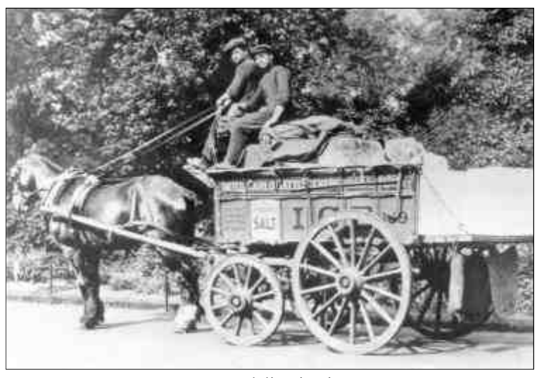
Ice cart delivering ice

and preferably broken to a powder. It should be rammed close with a space left around the walls which is filled with straw.