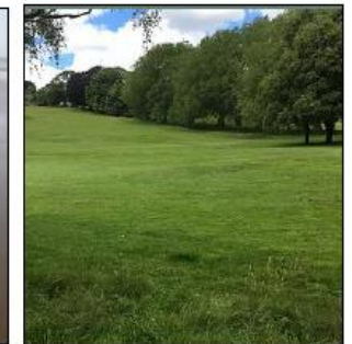
Parks & Designed Landscapes