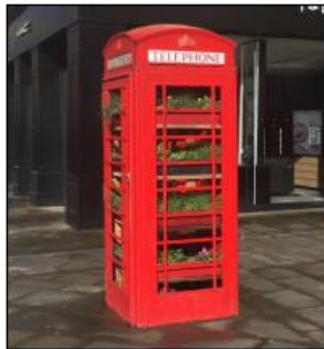
Civic Structures & Public Art