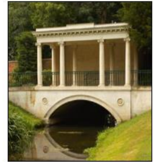
Registered Parks & Gardens