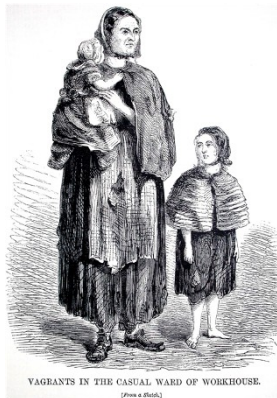
VAGHANTS IN THE CASUAL WARD OF WORKHOUSE. (From a photo.)