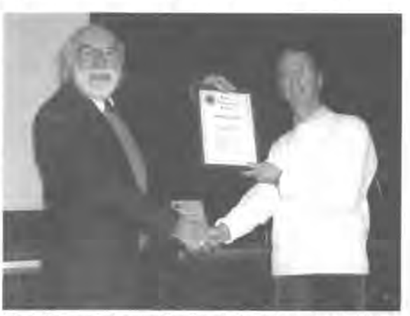
building of unusual plan was First Prize to the Leatherhead & District Local History excavated in 1883, 1888 and Society

David Bird reappraised the Villa at Chiddingfold. This 1st to 2nd century Roman building of unusual plan was excavated in 1883, 1888 and Society