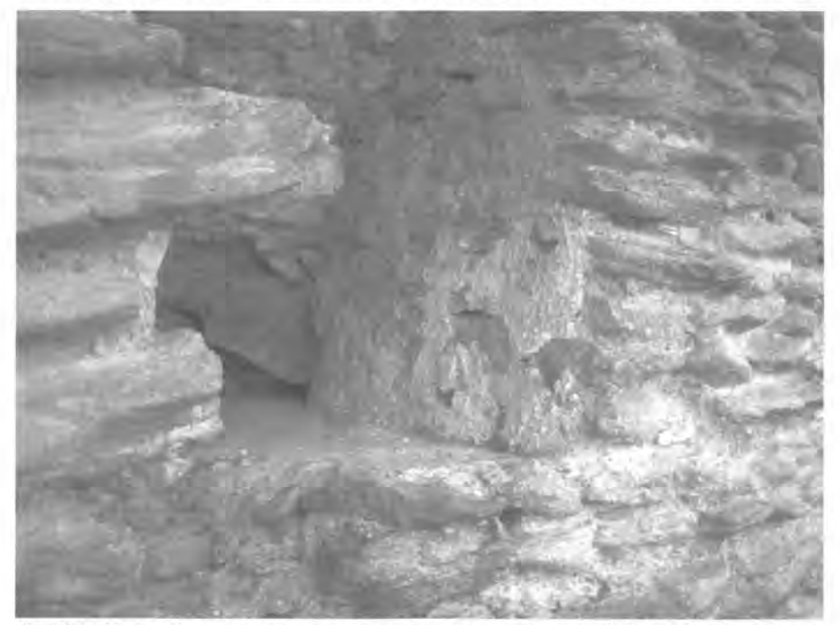
Guildford Castle: Original plaster and limewash on the side of a crenellation at the Great Tower.

During the work, several exciting discoveries have been made by removing the old pointing that obscured earlier features, and by having close access to the stonework. The most exciting find has been original crenellations at first floor level, which had been filled in when the walls were raised. Even more interesting is that some of their original rendering and limewash has been preserved at the sides and base where it was built over when the walls were heightened. Although we know that most