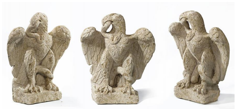
Below – Roman eagle funerary sculpture