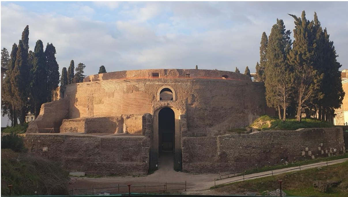
The Mausoleum of Augustus