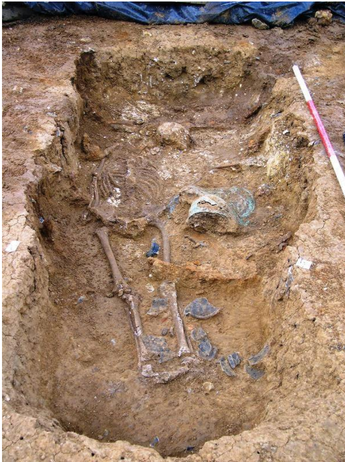
The recent North Bersted Warrior Burial