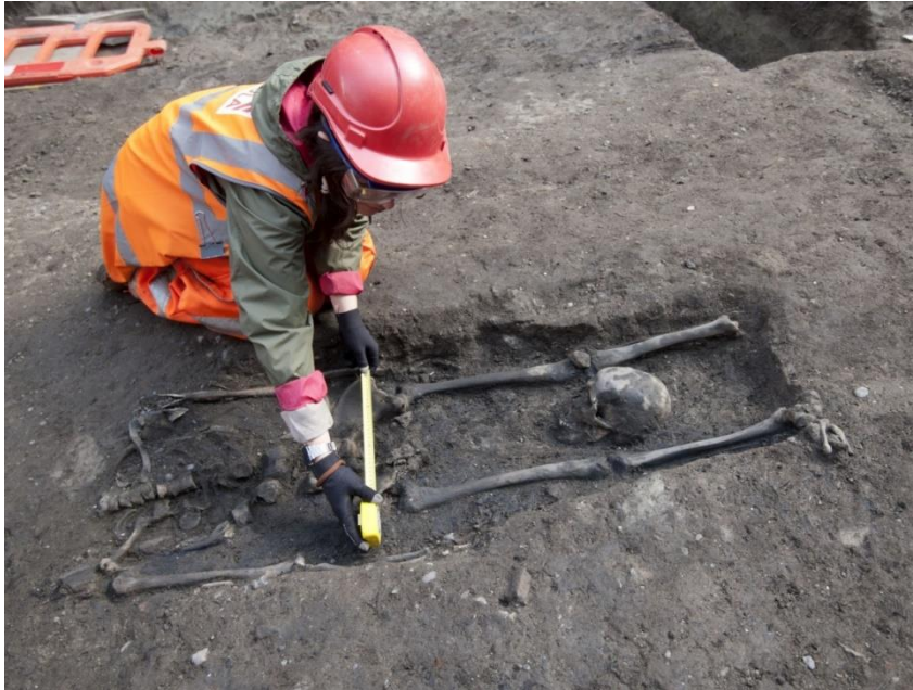
Left - Crossrail decapitation

The Roman cemeteries of London have been extensively excavated and published over decades. We still await a synthetic update of Jenny Hall's 1996 paper to draw together the myriad reports, and to provide a thematic understanding of the cemeteries' significance and their populations. Sadie Watson will provide a brief high-level paper on burial practice as observed in the City and Southwark, using several recently published (and unpublished) examples to illustrate how the complex picture of burial in an urban context is ever-changing with every new discovery.