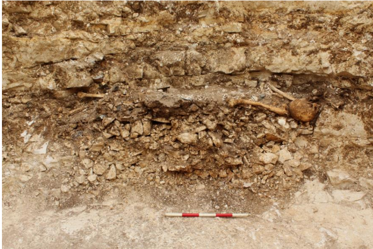
Human remains from Ewell shafts