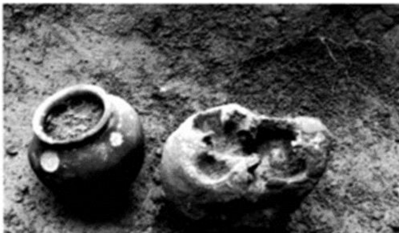
Human skull and jar at Gallo-Roman temple of Forêt d'Halatte